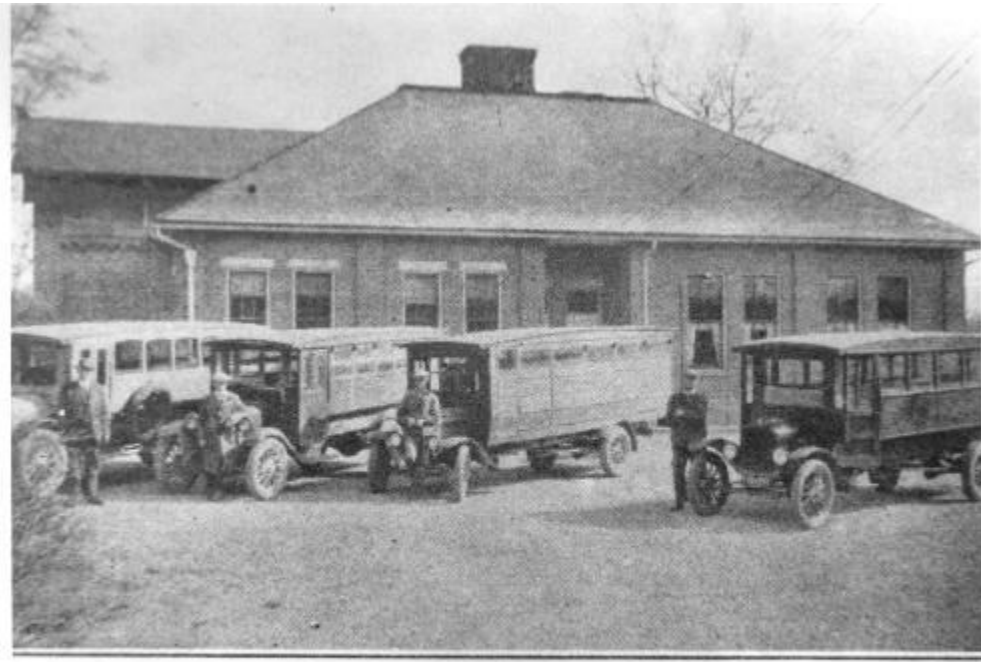
Grade School Building, Cable, Ohio.